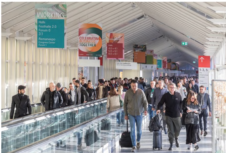
The trade fair trio of Ambiente, Christmasworld and Creativeworld is the global meeting place for the consumer goods industry.

Frankfurt am Main, 30 January 2024. "Celebrating Business Together" was the motto of this year's mega trade fair for the global consumer goods industry, consisting of Ambiente, Christmasworld and Creativeworld. A festival of records: with an increase of ten percent, 4,928 exhibitors presented their new products on over 360,000 gross square metres. Despite a rail strike lasting several days, around 140,000 visitors from all branches of trade and sales channels were inspired by a wealth of trends and innovations at the biggest event in the history of Messe Frankfurt. As the most international networking and ordering platform, the industry's one-stop shop with over 170 participating countries and regions provided orientation, inspiration and solutions to current challenges in the market.